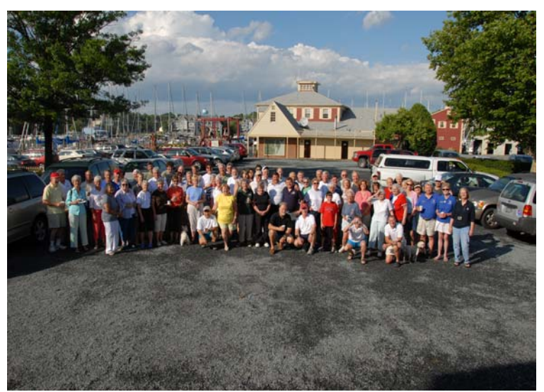
WPS members kick-off the festivities at the 2009 Annual Cruise Picnic and Commander's Reception

Thank you to everyone that participated in the 2009 WPS Cruise survey – the 2010 Cruise Committee listened to your input. There was a majority request to return to Baltimore to close the cruise and so we have arranged the last port-of-call at Baltimore Inner Harbour East (with newly completed renovations - we